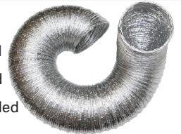
DFLX4 — 4' Extended DFLX8 — 8' Extended DFLX25 — 25' Extended

DryerFlex combines the ease of use and flexibility of foil flex with the fire resistance and airflow efficiency of semi-rigid transition hose. Constructed of crush and puncture resistant 100% aluminum, it is UL2158A Class 0 Listed and maintains a 4" diameter at all lengths.