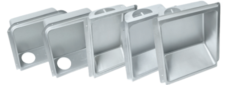
DB-3D DB-4D DB-350 DB-425 DB-480

In-wall dryer connection makes homes safer, roomier and more efficient. Laundry appliances can be placed flush to the wall without the risk of crushing the hose or restricting airflow.